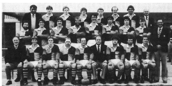
NZ Harlequins Rugby Team 1983