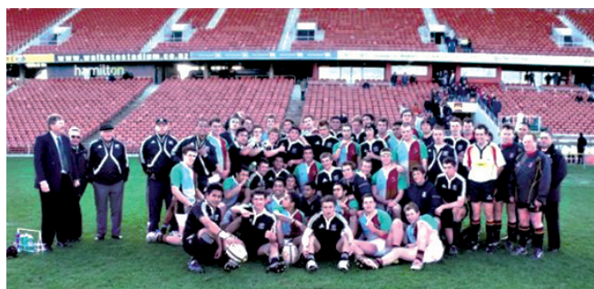
NZ Harlequins Rugby U17 Team versus NZ Area schools 2010