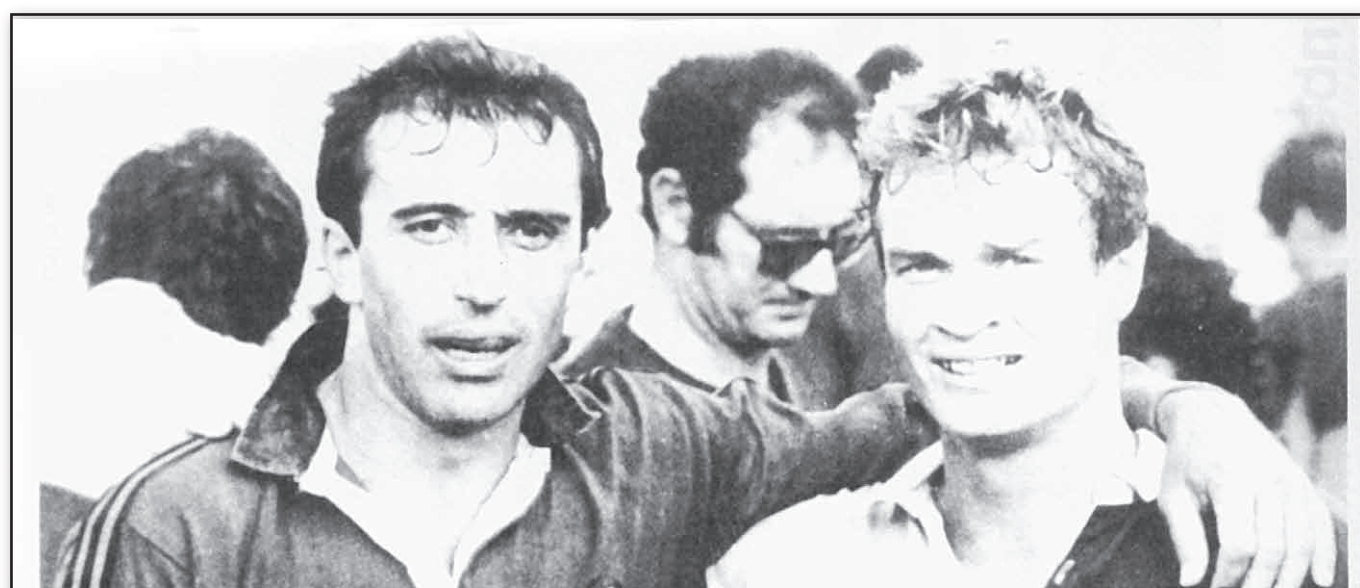
Champion five-eighths, Hugo Porta (Argentina, left) and Grant Fox (New Zealand) after they had opposed each other in the Harlequins v President's XV match at Rugby Park, Hamilton, in 1985.