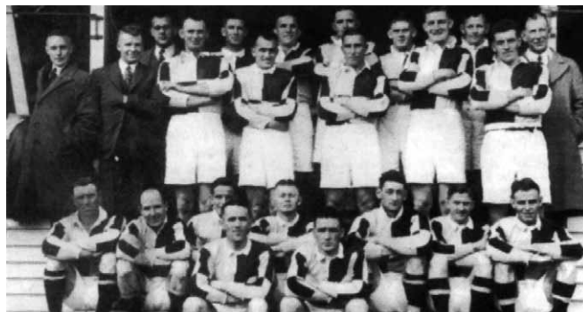
NZ Harlequins Rugby Team 1939

Annual matches with NZ Area Schools and the NZ Vikings Club from Northland have become regular features. A NZ Harlequin camp, backed by the NZ Rugby Foundation and supported by the Waikato Rugby Union for approx 40-45 players, is staged at St Paul's Collegiate annually.